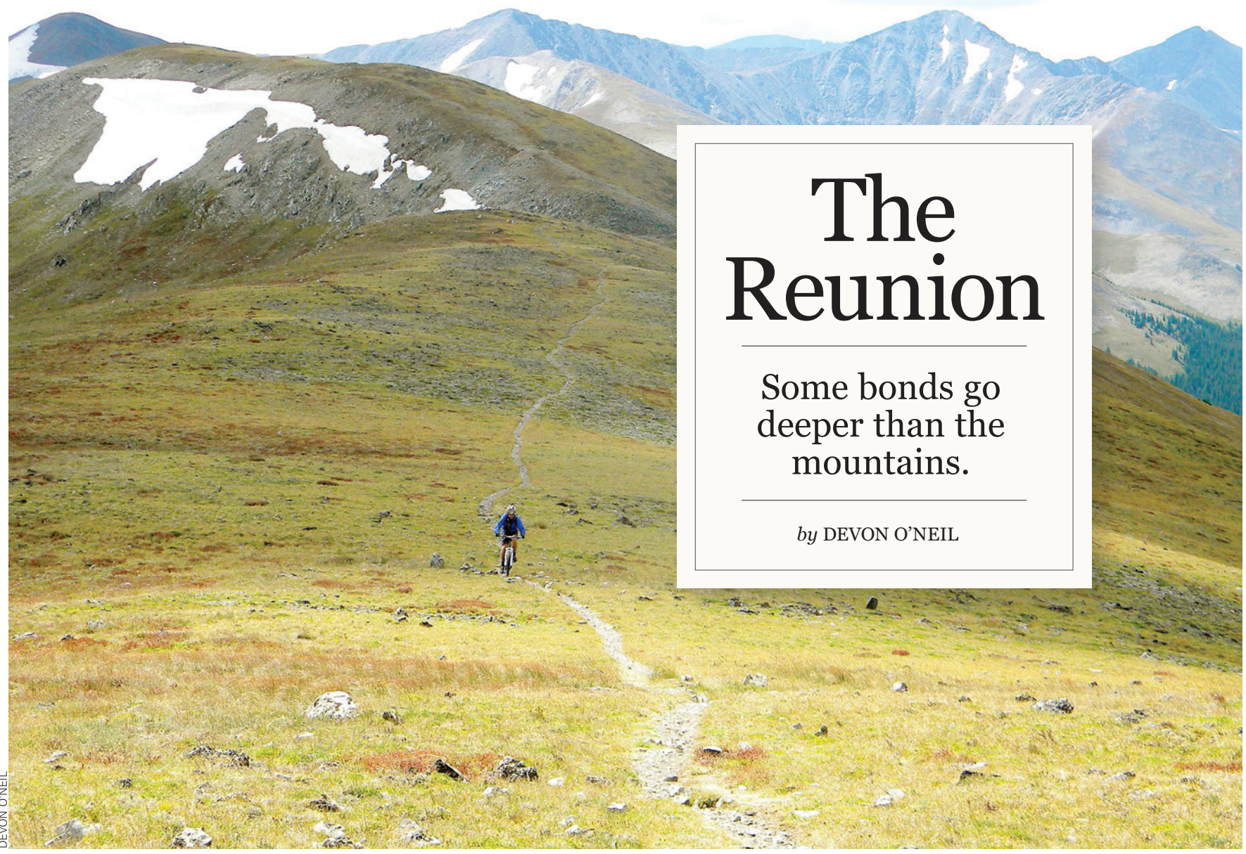
MOUNTAIN HOME: FINDING SOLACE ON BRECK'S WHEELER TRAIL

t would be easy to say I didn't know why I was going, but I knew, even if I still struggle to explain the reason. It wasn't because everyone had told me how much fun their 10-year college reunion was, and how much fun mine would be. Or because all my old friends would be there—the truth was, thanks to work and kids and whatever else keeps people from their past, only a few had committed. No, I went for a strange but undeniable reason: I wanted to revisit an era in my life that I know is dead, and was sure I no longer needed.