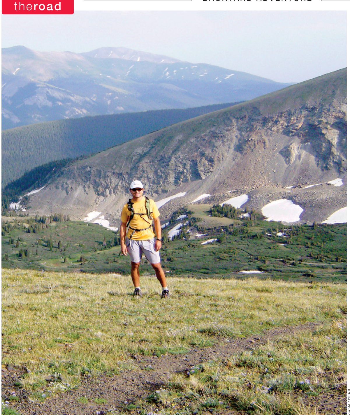
THE CALL OF THE HIGH PEAKS: "WHY WOULDN'T WE JUST STAY HERE?"